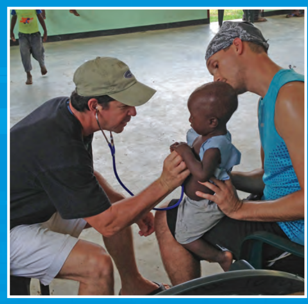
One of our medical clinics in the Suriname jungles.

EXTRAordinary Commitment and First Fruits Offering!